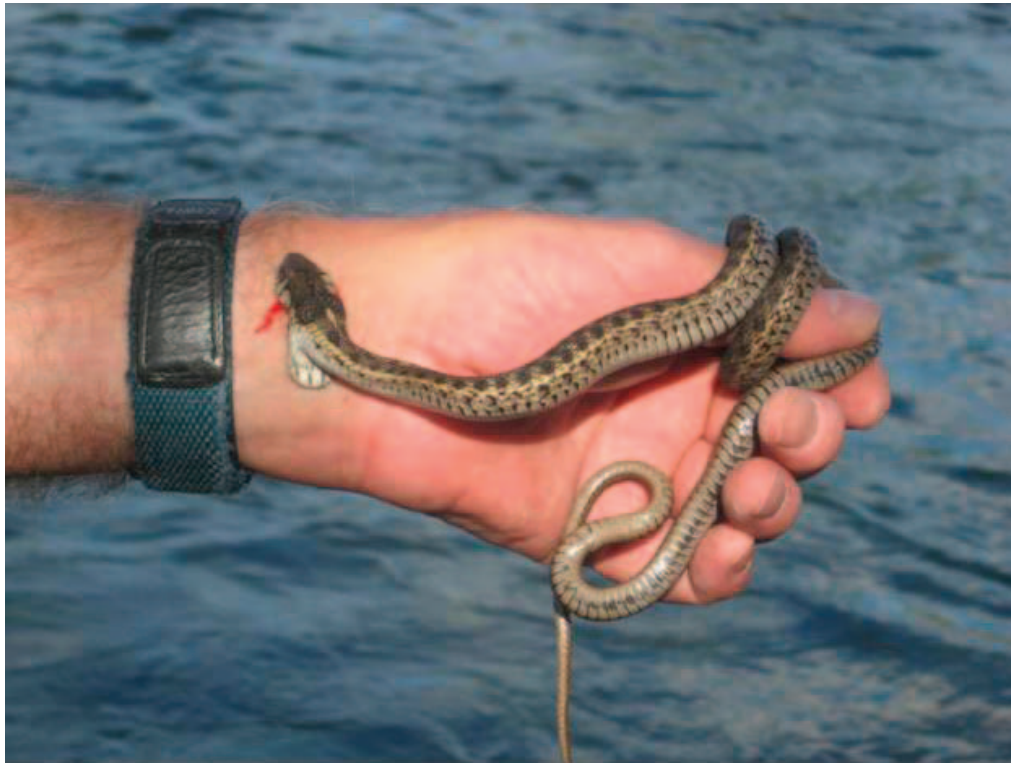
FIG. 7. A newly captured Thamnophis elegans vigorously bites the author's wrist.

anecdotal, but I do not think I have seen any gartersnake move with such urgency in response to my approach. Real life-and-death situations call for desperate effort, but can snakes somehow distinguish the differential threat posed by a mink and a benevolent human?